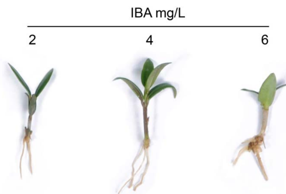
Figure 2. Increasing IBA concentration resulted in more callus formation, but reduction of growth of roots of olive 'Mission' explant.

Plantlets acclimated under mist unit in a greenhouse and transferred to outdoor after 3 weeks successfully. About 12% of the plantlets lost during this step.